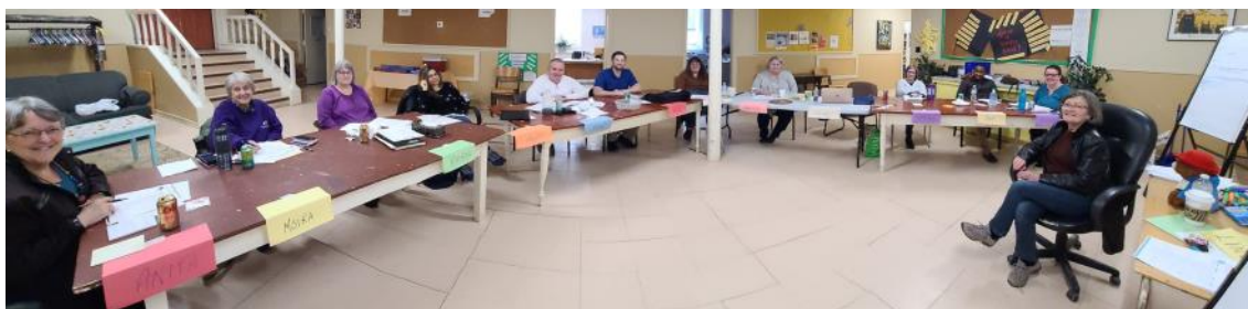
Strategic Planning Session, April 2022 Big Brothers Big Sisters of Fredericton and Oromocto, Inc.

Thank you for your support over the past years and for your efforts to make magic happen for even more children.