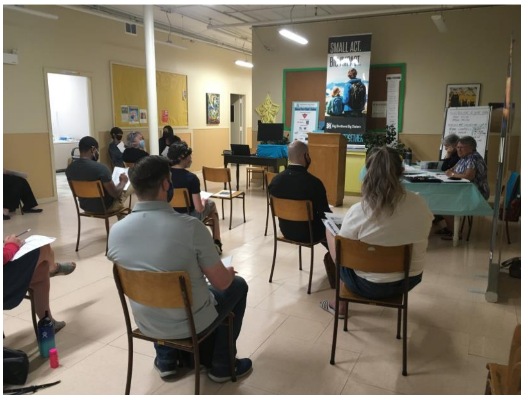
2021 Annual General Meeting Big Brothers Big Sisters of Fredericton and Oromocto, Inc.